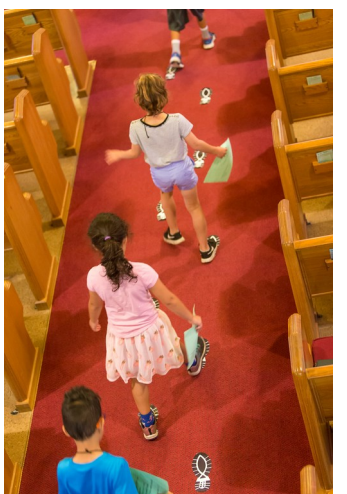
VBS children followed those footsteps to worship time

Mysterious footsteps went down the center aisle of the BCMC sanctuary