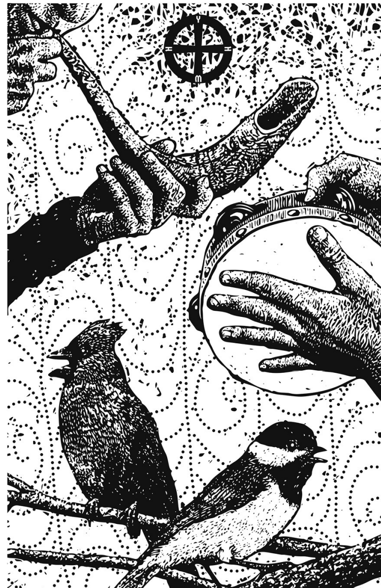
Praise the Lord! (Psalm 150)