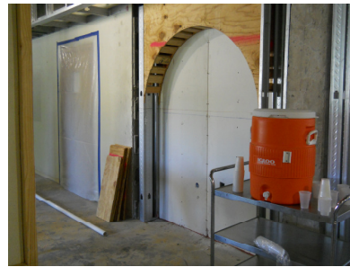
Water fountain will go in the arch — and then we won't have to use the orange jug!