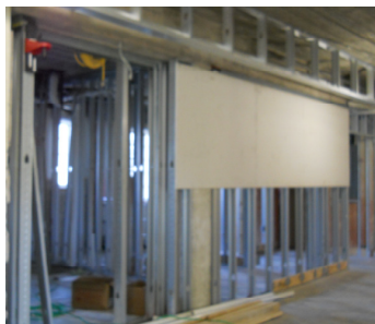
New restrooms go behind this piece of sheetrock