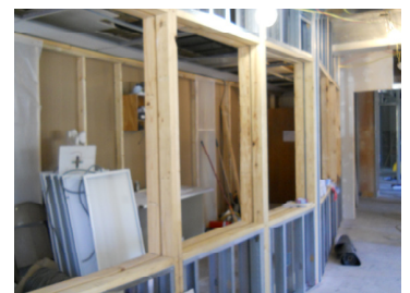
The wall for the new nursery