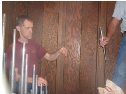
The Dobson Organ Builder's technician takes out pipes and hands them to the next person for removal from the organ chamber.