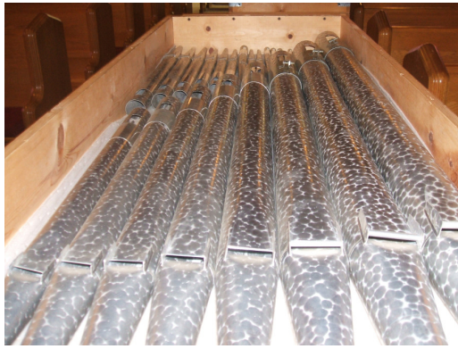
Pipes were placed in wooden boxes for shipping to Iowa