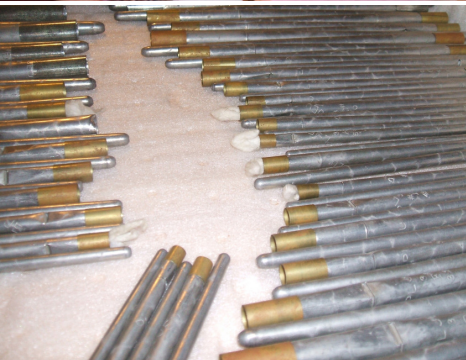
Some of the pipes have cotton stuffed in them. That's because they didn't "speak" well, so they were silenced. When they come back, all of the pipes should "speak".