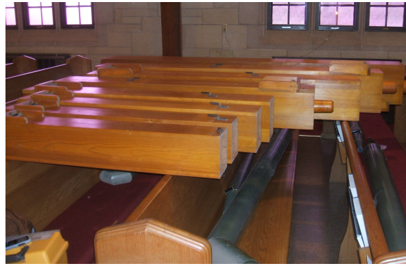
Low bass pipes await loading on the truck