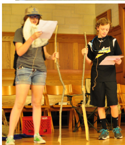
There was drama!