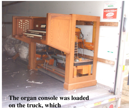
The organ console was loaded on the truck, which was backed up to the front doors of the church.