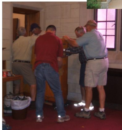
It took a lot of people to move some of the heavier pieces, like the windchests, out of the organ pipe chamber.