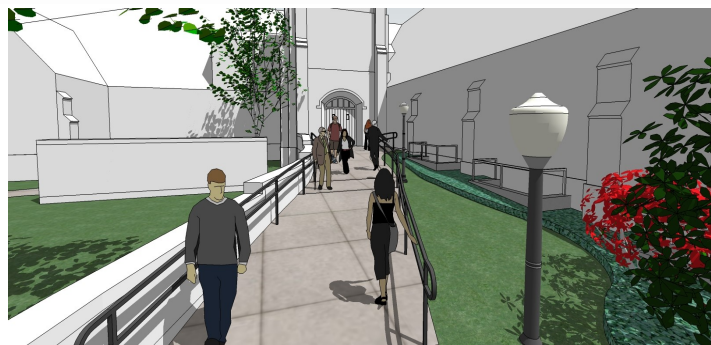
Entrance ramp, looking east toward main entrance