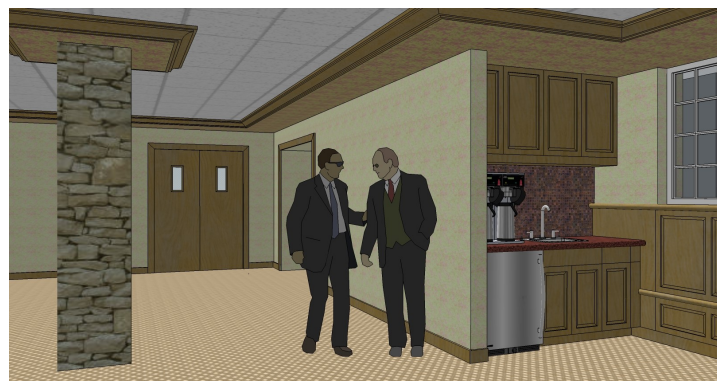
Looking south-west, toward sanctuary entrance (south wall) and kitchenette (south-west corner)