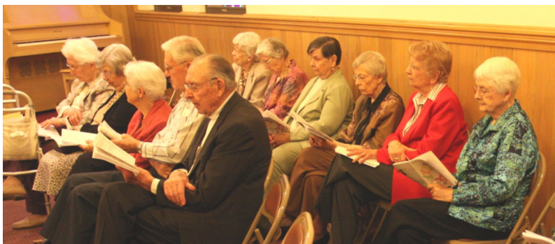
Members of the Chapel Class