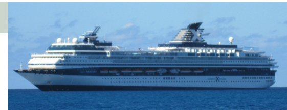
Celebrity Cruise Lines — The cruise ship Mercury