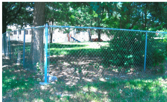
The back corner of the church playground.