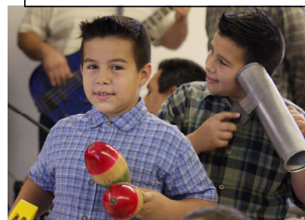
Casa Betania service