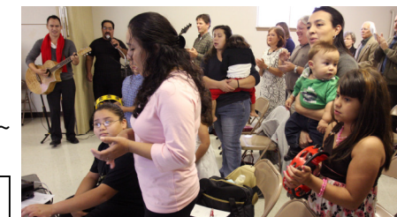
The service at Casa Betania