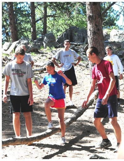
Group building exercises