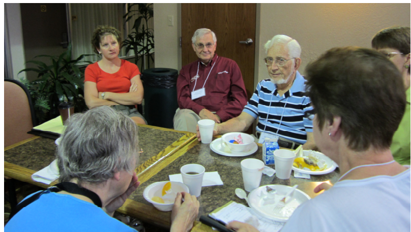
BCMC delegates at a breakfast meeting 2012 WDC Assembly-Oklahoma City, OK

The preceding comments were written from the point of view of a listener who thoroughly enjoyed the concert. On a perhaps more important level, the members of