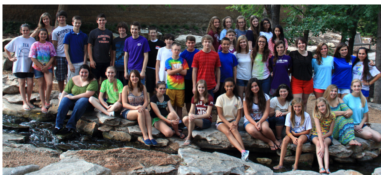
The Salt and Light Youth Choir from St. Andrew United Methodist Church, Plano, TX

It is time to move from the planning phase into the implementation phase. Therefore, it seems appropriate to retire the term "The Long Range Plan" and adopt a new