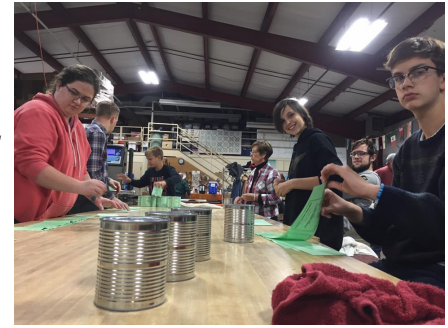
The Youth Group at MCC Meat Canning