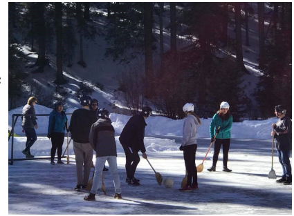
BCMC Youth Group at Snow Camp—2018