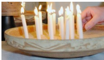
Newton Chorale Rehearsals Begin Soon