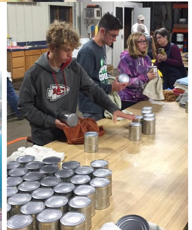
BCMC Youth Group help at Mennonite Central Committee Service Night